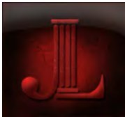
Junior League of Las Cruces, Inc.